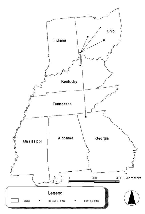
Figure 1. Map of long-distance (>100 km) dispersal of Red-shouldered Hawks banded as nestlings in southwestern OH, 1955–2002. Lines join natal sites and encounter locations. All birds shown were recovered dead and four of the five birds shown were <663-d old at recovery.